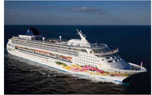
(Actual cruise may differ from the ship shown)

Earn a 3-day, 2-night cruise with Paperly, plus a $250 travel allowance.